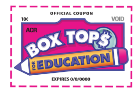
Old Clip-able Logo

Box Tops for Education is making its way into the 20<sup>th</sup> Century! Download the Box Tops app and scan your receipt after purchasing any items with the new Box Tops Logo. The school will automatically receive 10¢ for each Box Tops item. During the transition, you may still see some of the old logos. They can be clipped and sent in to the school. Visit boxtops4education.com for more info.