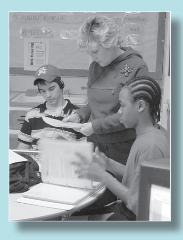
Does your gifted child face learning challenges?