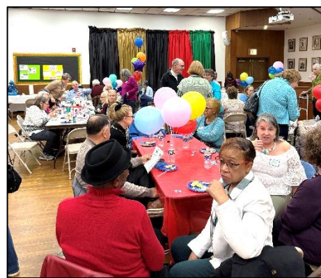
March 7, Homecoming Party

Our Retiree Homecoming Party on March 7, 2025 was a huge success. All retirees, regardless of membership in MCPSRA, were invited